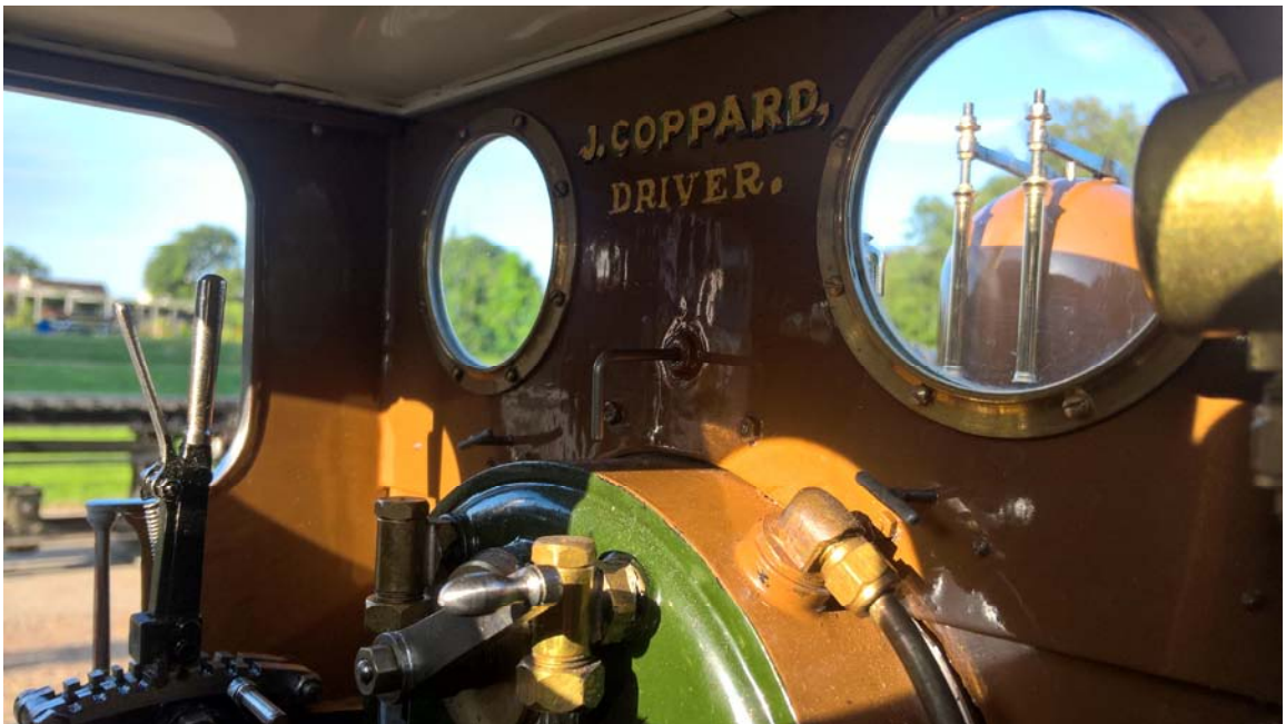
Picture above: A close up cab view of 'Minories', including the hand written lettering of the regular driver of the full size locomotive. Note the position of the gauge to the right and out of shot is the proper shaped fire hole door!