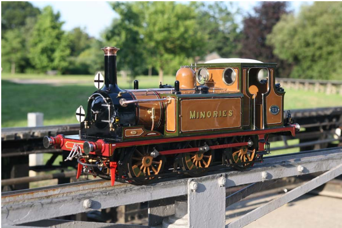
Picture above: 'Minories' pictured on the steaming bay turntable at Beech Hurst