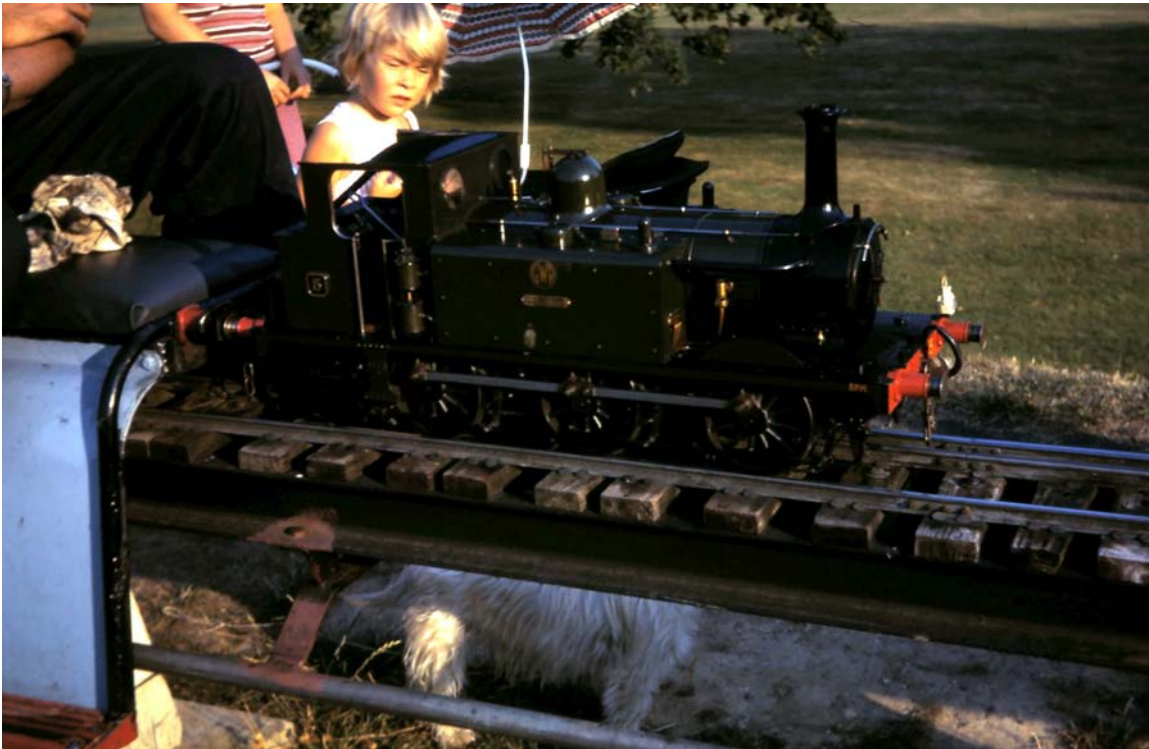
Picture above: Bob's 'Terrier' at Beech Hurst with the old light blue trucks

In addition to Bob's, I thought it would be nice to share a couple of pictures of a visiting 'Terrier' we had on static display during the Beaver's evening back in July. This fine example, named 'Minorities', belongs to a friend and we were very privileged to have her visit ( see both pictures next page and thanks to Chris S for the close up cab view ). The locomotive is brush painted, including the lettering and lining, and she is absolutely superb, almost too good to run! For the Beaver's visit she was perfect because many of the children can relate the locomotive to 'Fenchurch' or 'Stepney', which are both based at the Bluebell Railway. Chris was also able to explain the difference between the larger freight and passenger locomotives (we used the 'Black 5' and 'King Arthur') and those smaller ones used for lighter duties, such as 'Terriers'. I think it is safe to say the children were suitably impressed!