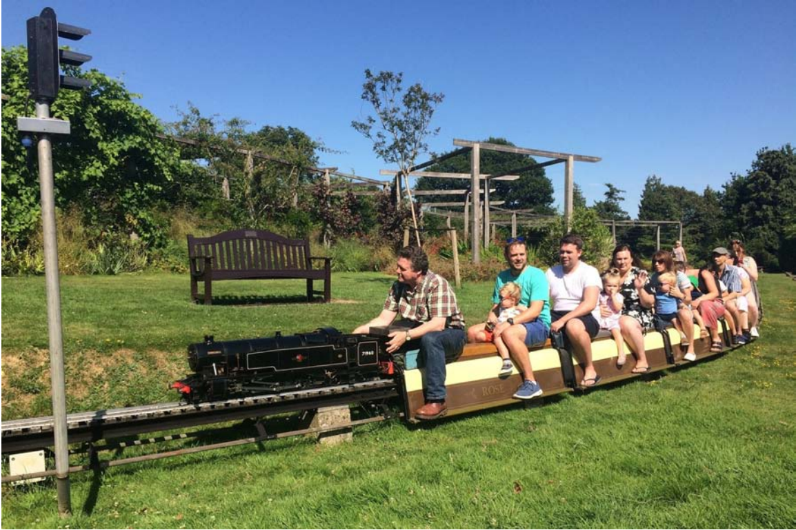
Picture above: Clive passes signal 2 with 'Wharfedale' and a fully loaded train