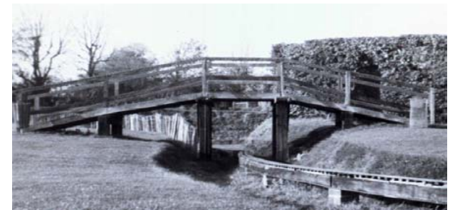
The Old Wooden Bridge - Late 1954 (IPB-0079)