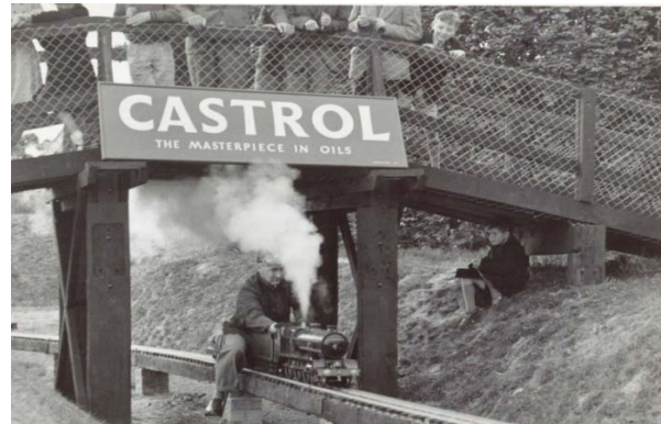
The Old Wooden Bridge - Early 1954 (IPB-0003)