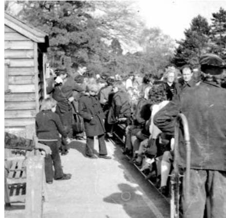
The Old Station in Service - Late 1960's (IPB-0812)