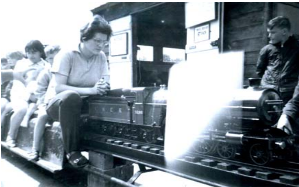
The Old Station in Service - 1960's (IPB-0516)