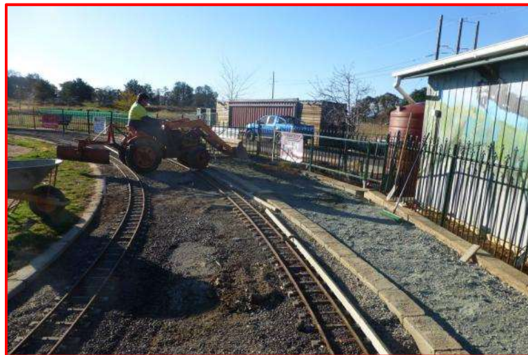
Darryl unloading more road base with the new station nearly ready for concrete. More as these works progress.