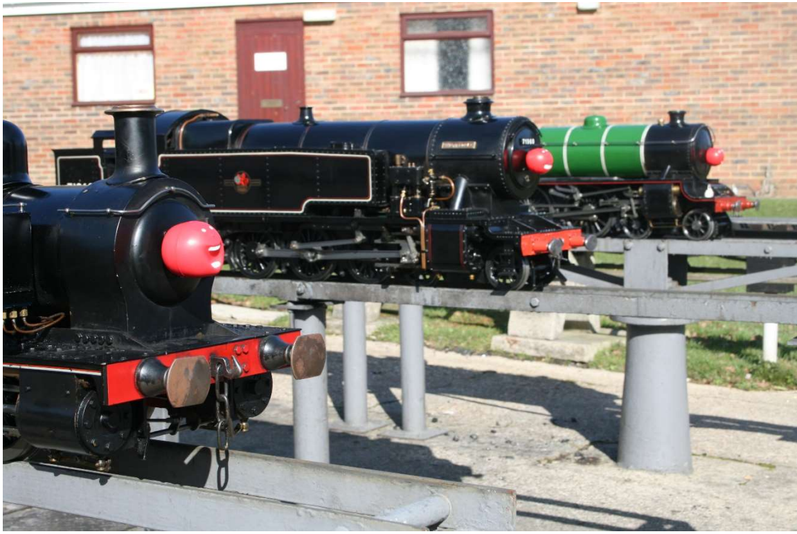
Red Nose Day 08/03/2009