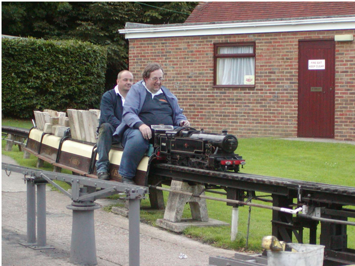
Earning its Keep 26/08/2008